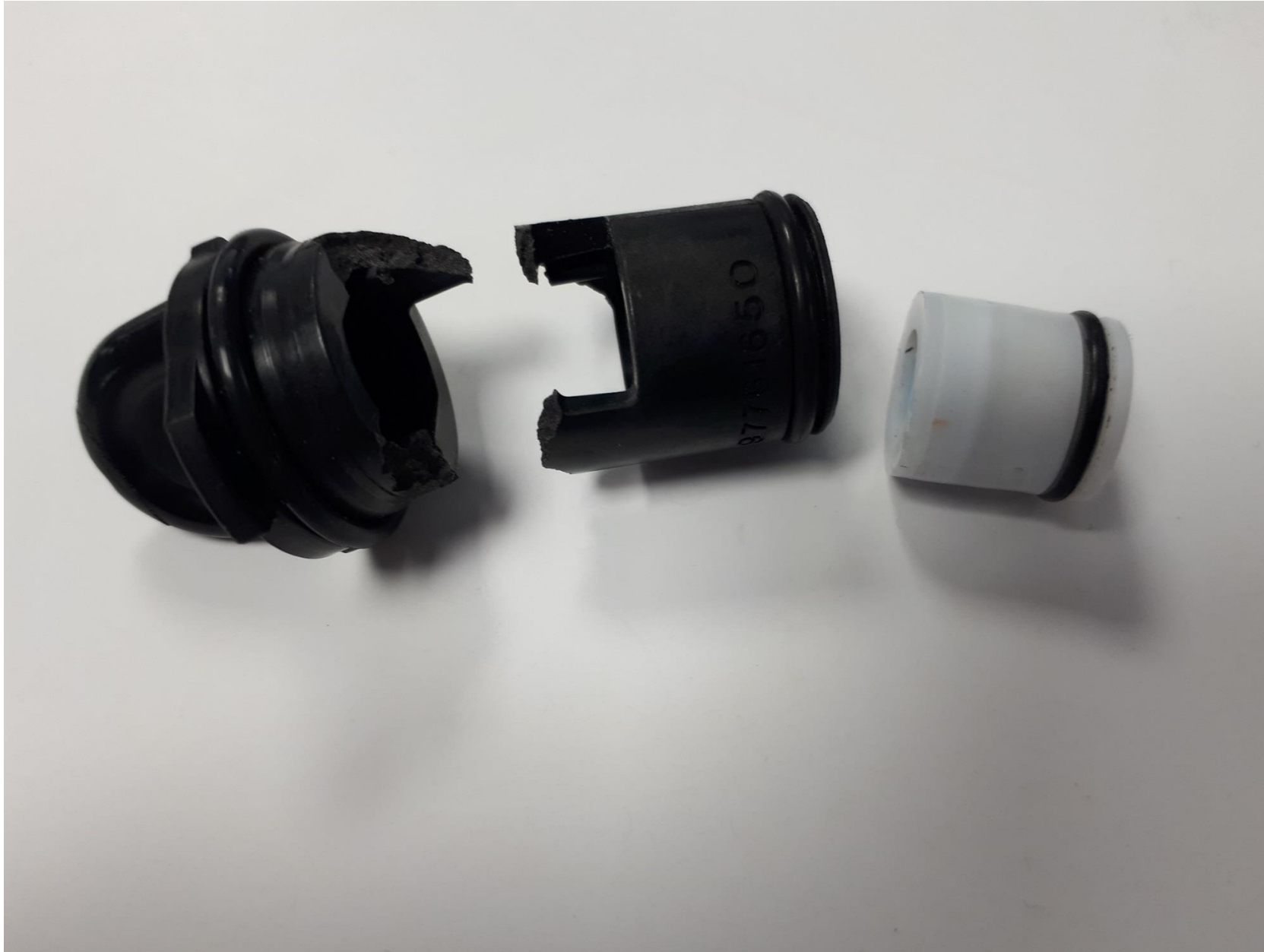
This shows the damage caused to the flow regulator/cold water filter.