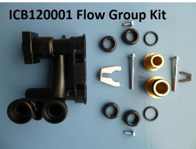
ICB120001 Flow Group Kit